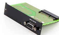
WiFi Expansion Card (#CG2101-11921)