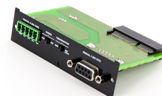
Serial Expansion Card (#CG1101-11919)