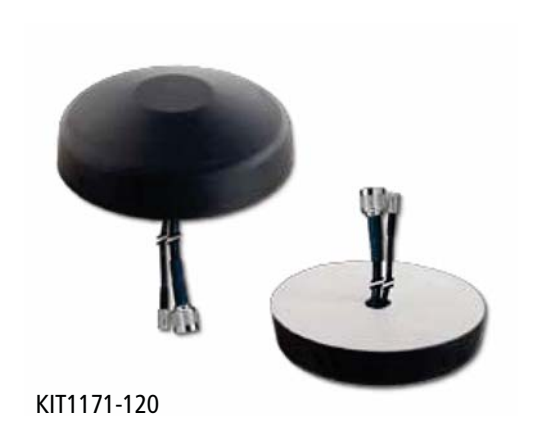
Adhesive mount option available on Low Profile GPS Antennas

More Info: 800.323.3757 www.lairdtech.com