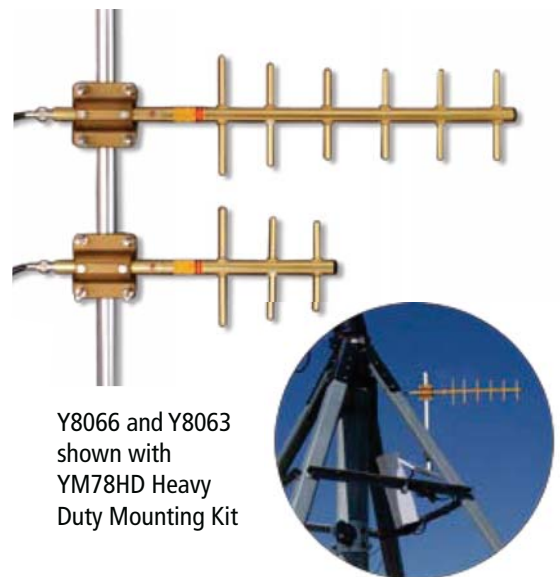
Y8066 and Y8063 shown with YM78HD Heavy Duty Mounting Kit